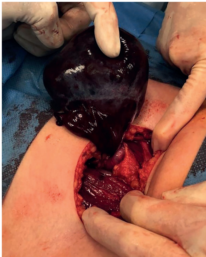
Fig. 1 The torsion of the right ovary. The right ovary size was 9 cm in diameter and ovarian tissue was completely twisted 720 degrees.

A 10-year-old previously healthy girl was admitted to the hospital, as emergency due to abdominal pain, nausea and repeated vomiting. The patient presented with a complaint of intermittent lower abdominal pain for two days that worsened over last 12 hours. On physical examination a palpable firm mass was identified and distension of the abdomen was observed. The ultrasound scan revealed mass of cystic-solid composition without calcification and other three cystic masses in the pelvic region. The size of