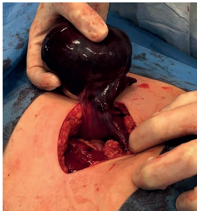
Fig. 2 The right ovary after detorsion. Due to irreversible ischemic damage to the ovary, right oophorectomy was necessary.

Teratomas are the most common histologic subtype of childhood ovarian germ cell tumors (2). Their optimal operative management in this age group still remains unclear because of the rarity of such tumors and depends on retrospective studies (1, 5). In scoping review from Poland authors have revealed a number of knowledge gaps in the