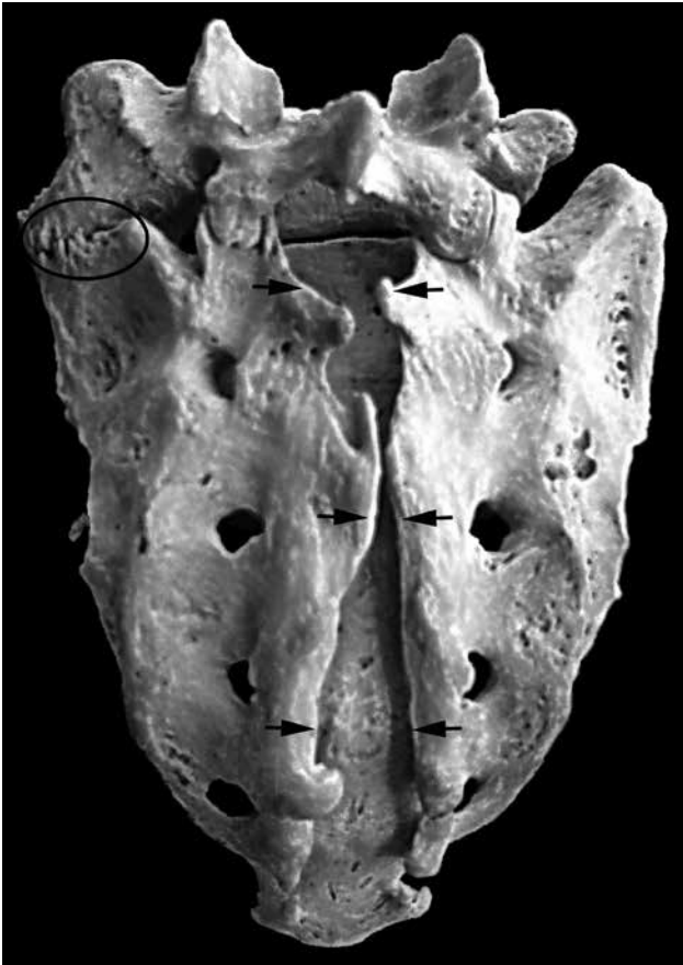
Fig. 1: Posterior aspect of the partially fused sacrum and fifth lumbar vertebra (L5). The arrows demonstrate the incomplete fusion of the posterior vertebral laminae of the sacrum (spina bifida occulta). The partially sacralized L5 vertebra and its enlarged transverse process fused with the sacral basis with pseudoarthrosis and synostosis is also shown on the left side (circle).