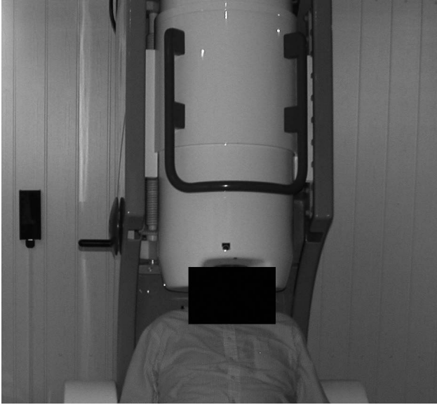
Fig. 1: The 122-channel MEG system with the patient during the measurements.