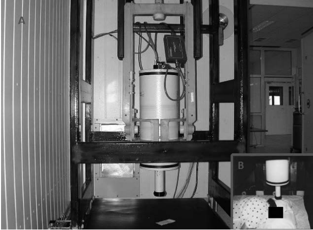
Fig. 3: A) The one-channel MEG system. B) The patient during the measurement.

the behavior of delta and theta rhythms. Figure 4 shows the left temporal lobe of an epileptic patient before and after the application of TMS. We observe a significant reduction of the magnetic field in the spectral amplitude maps after the application of TMS.