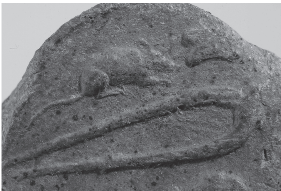
Fig. 8. Mice with astragals, sealing 1a.