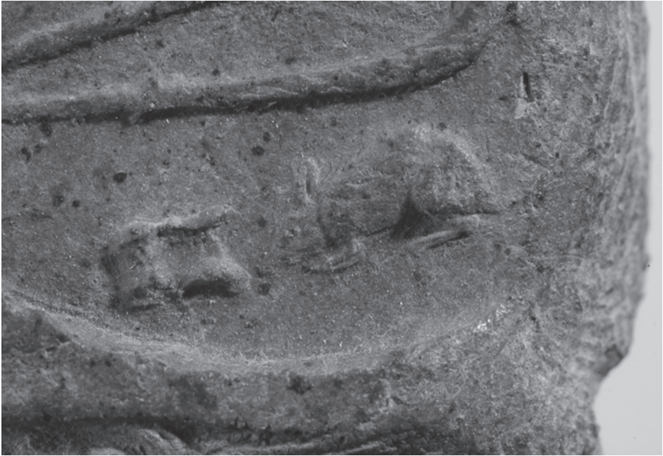
Fig. 9. Mice with astragals, sealing 1a.

The story of mice helping in astragal game reminds of one short story by William Saroyan On young man and a white mouse . The subject is unique, but maybe characteristic for the life at the margins of the world, with not highly respected moral values.