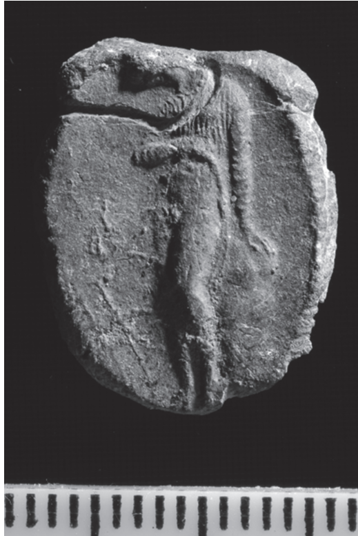
Fig. 3. Hermaphrodite, sealing 5.

right arm bent at elbow, holding rolled cloak (?) or raised chiton to show his genital, left arm put on a rock. High hairdo with coif, a stream of hair falls on the back. Rear side flaked away. Deep fissure in the left upper part of the sealing. Only one seal impression preserved. Fine light grey clay. W. 14, H. 18 mm.