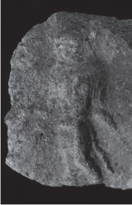
Fig. 5. Comic actor, sealing 12b.