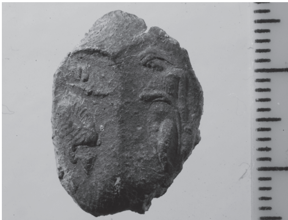
Fig. 4. Hermaphrodite, sealing 6b.

by garlands on the fourth day of every month. As the face with pointed nose is very similar to the group discussed above he might well be made by the same local gem engraver; it shows also similar taste.