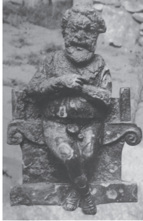
Fig. 6. Comic actor, bronze appliqué of a throne.

was popular among the 4 th to 3 rd century BC terracottas and also as thrones appliqués (cf. Lazov 1996).