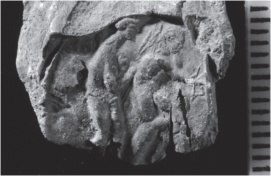
Fig. 2. Two warriors or Heracles and Iolaos with Hydra, sealing 4.

The rear side of the sealing is slightly concave, with traces of parallel thin threads of some light textile. Less fine clay than that of other sealings, brown to grey. W. 18, H. 18, Th. 4 mm.