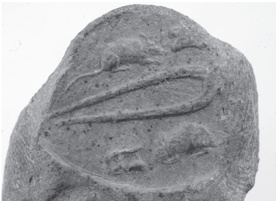
Fig. 7. Mice with astragals, sealing 1a.