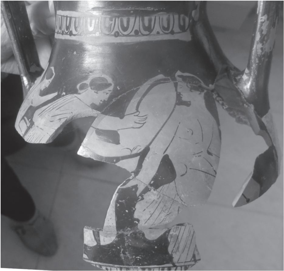
Fig. 11. Rhea and Kronos, scene on Attic hydria, the late 4th century BC

its final destruction by the Celts in 279 BC: it was first destroyed in the eighties of the 4 th century BC, kept its autonomy under Thracian rulers and even after the conquest of Thrace by Philip II, which left here only little damage. It was the last harbour on the Hebros and centre of trade on the Thracian plain with supervised market colonnade also at the Eastern Gate where carts arriving from south, southwest and north unloaded and loaded their goods. Pistiros had several workshops of bronze- and ironsmiths, mines of iron, copper and gold in the vicinity and enough timber. Its kilns produced fine pottery and tiles and some role of slave trade can also be supposed (cf. for the functional analysis Bouzek 2016b). Slightly similarly sounding Masteira mentioned by Demosth. Orat. VIII ( De Chers. ), 44; X ( Philip. IV ), 15 and which some scholars tried to be identified with Pistiros, was described by him in bright colours; the air of the seals and the pelike may have been part of the atmosphere in the emporion .