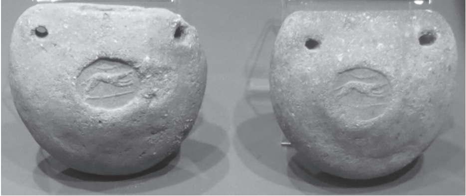
Fig. 10. Loom-weights with impressions: running dog.