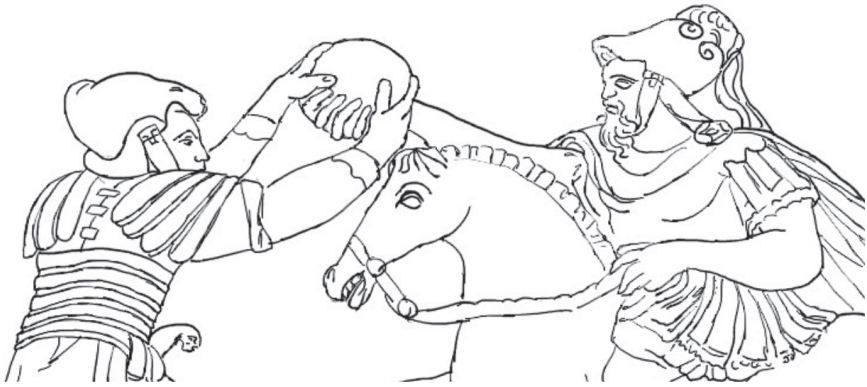
Fig. 2. Paolo della Stella, Allegory of Dynastic Succession (partial reconstruction indicating position of fingers holding the globe), 1538–1550 (drawing Nina Bažantová).

The erroneous reconstruction was inspired by a different coin from the reign of Titus: one showing the standing togate Vespasian presenting the globe to the standing togate Titus. Under the globe is a rudder, another symbol of world rule (Carradice, Buttrey 2007: 209, no. 161–162). This coin was published by Vico (Fig. 4), who shortened the inscription PROVIDENT AVGVST to PROVIDEN AVG and left out the rudder (Vico, Zantani 1548: 51; Vico 1554: LI). We find the same coin also in Du Choul’s book (Fig. 5) which was published ten years later (Du Choul 1556: 68). Du Choul comments on the coin in a similar vein to Erizzo: “in ancient times, Providence was considered to be a deity ... They represented her as a woman in a long dress holding a sceptre in one hand and the globe in another ... In this way, she was represented on medals of Trajan ... The other emperors (such as Titus) represented her with a rudder and a globe, with which they denoted the rule of the world” (Du Choul 1556: 66–67; my translation). On the coin published by Vico and Du Choul, there is an inscription Providentia Augusti (Imperial Providence), which appeared on the coins of many Roman Emperors. In the sixteenth century, it was known that the orderly imperial succession was an important aspect of imperial