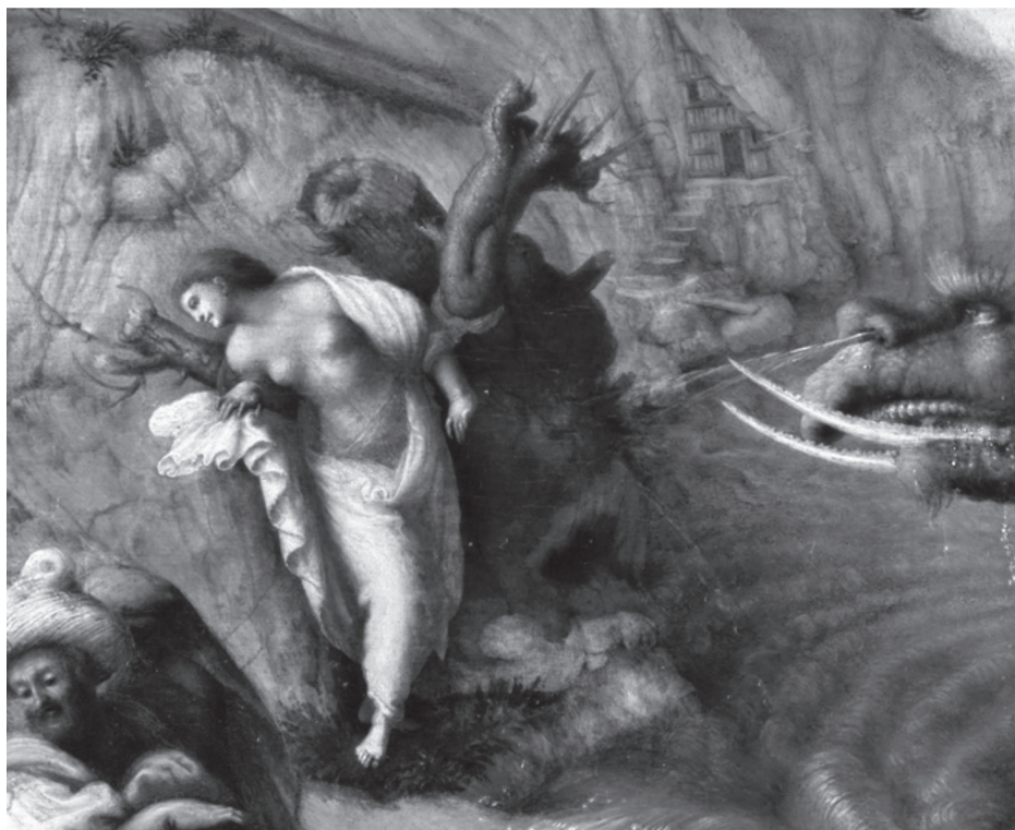
Fig. 9. Piero di Cosimo, detail of Andromeda and broncone , 1515.

The figure of Andromeda in the Belvedere relief was evidently inspired by a painting of 1515 by Piero di Cosimo (Geronimus 2006: 108–115; Hirschauer, Geronimus 2015: 202–204). 2 His Andromeda is tied to a huge old tree as in a woodcut of 1497 (Bonsignori 1497: e2r; Díez Platas 2015), but with cut-off branches and new shoots sprouting from the stump (Fig. 9). This trunk evokes the broncone , which was one of the emblems of the Medici, who celebrated the indestructibility of their dynasty in this way (Cox-Rearick 1984: 234–235; Walker-Oates 2001; Langdon 2006: 29–30). Although all but one branch has been cut off, that branch may sprout again. The Medici were repeatedly removed from power in Florence, but always regained the city and restored their power. Three years before Piero's image was created, the Medici triumphantly returned to Florence from the exile which they had endured since 1494. Piero's Perseus can be regarded as the alter ego of a member of Medici dynasty, who ended the Republic. Hero slew the monster (Republican establishment) and freed Andromeda (Florence). Andromeda is not chained by iron, as we see in all the later depictions. She is fastened to the tree stump with a ribbon. The stump of the tree (Medici dynasty) does not imprison Andromeda; on the contrary, it provides her with a decorative and protective enclosure.