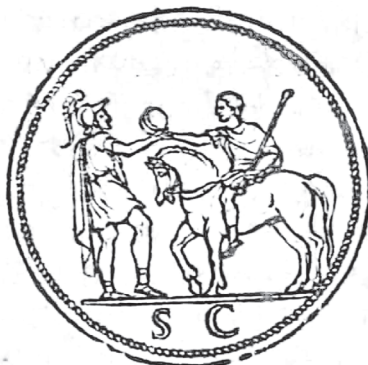
Fig. 3. Incorrect reconstruction of the reverse of the sestertius of Titus minted in 80–81 AD, woodcut (Erizzo 1559: 195).

The erroneous reconstruction was inspired by a different coin from the reign of Titus: one showing the standing togate Vespasian presenting the globe to the standing togate Titus. Under the globe is a rudder, another symbol of world rule (Carradice, Buttrey 2007: 209, no. 161–162). This coin was published by Vico (Fig. 4), who shortened the inscription PROVIDENT AVGVST to PROVIDEN AVG and left out the rudder (Vico, Zantani 1548: 51; Vico 1554: LI). We find the same coin also in Du Choul’s book (Fig. 5) which was published ten years later (Du Choul 1556: 68). Du Choul comments on the coin in a similar vein to Erizzo: “in ancient times, Providence was considered to be a deity ... They represented her as a woman in a long dress holding a sceptre in one hand and the globe in another ... In this way, she was represented on medals of Trajan ... The other emperors (such as Titus) represented her with a rudder and a globe, with which they denoted the rule of the world” (Du Choul 1556: 66–67; my translation). On the coin published by Vico and Du Choul, there is an inscription Providentia Augusti (Imperial Providence), which appeared on the coins of many Roman Emperors. In the sixteenth century, it was known that the orderly imperial succession was an important aspect of imperial