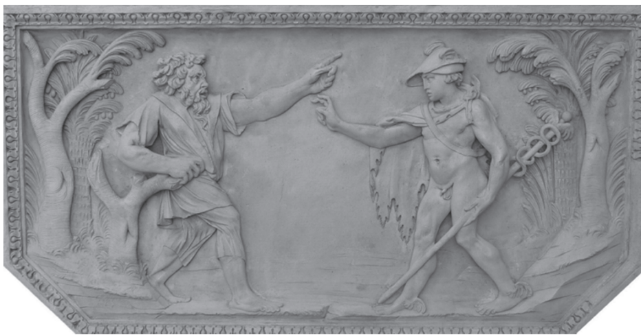
Fig. 11. Paolo della Stella, Mercury Orders Aeneas to Leave Carthage, seventh spandrel of the western façade of the Prague Belvedere, sandstone relief sculpture, 1538–1550.