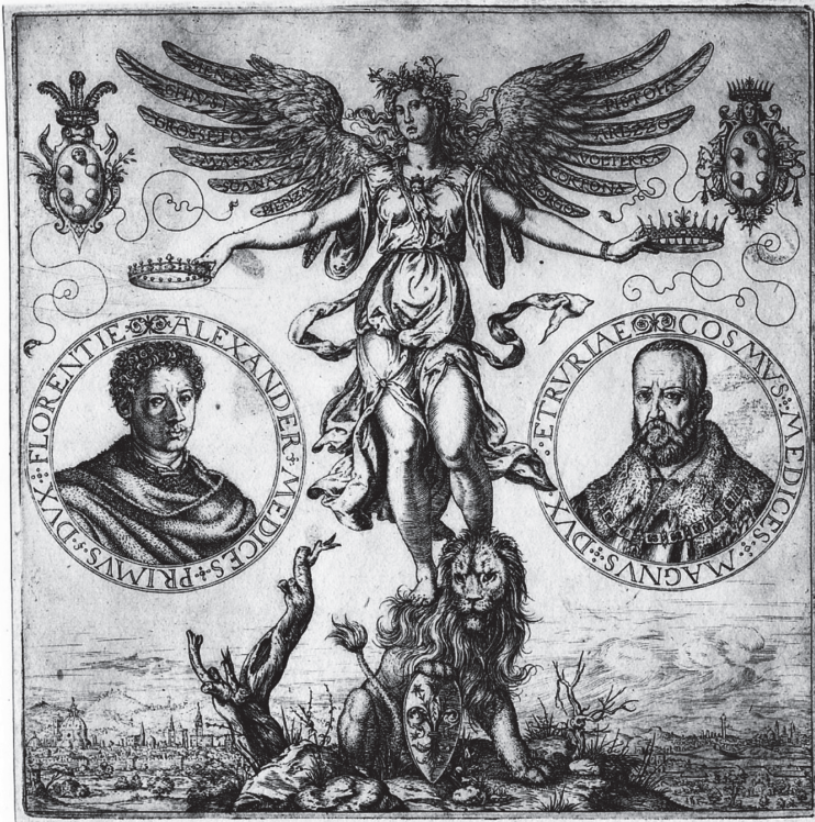
Fig. 10. Martin Rota, Alessandro, and Cosimo de' Medici crowned by a goddess standing on a lion, engraving from 1569–1574.

In Piero di Cosimo's image, the broncone is anthropomorphic; we clearly distinguish a face with an open mouth. The focus of the sea monster is not Andromeda, but this face. The dragon (Republican government) seems to be attacking the Princess (Florence), but a stream of water coming out of his nostrils falls not on Andromeda, but on the broncone's face (Medici dynasty). The stream of water has a symbolic meaning. The more a tree is threatened, the more it grows, exactly as in the traditional wisdom, that what does not kill us, makes us stronger.