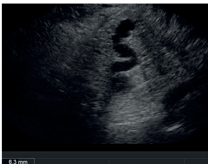
Fig. 3 Pancreatic adenocarcinoma of the uncinata process causing dilatation of the pancreatic duct to 6.3 mm in the neck of the pancreas.