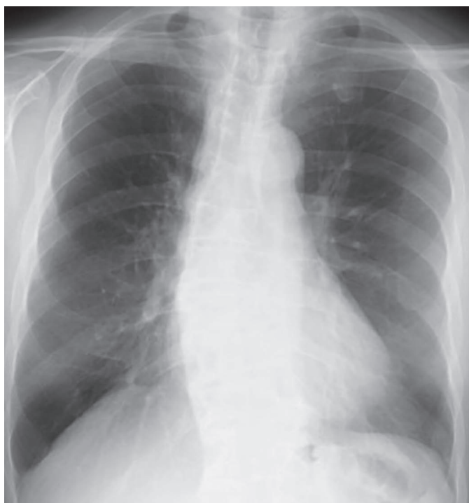
Fig. 1 A chest radiograph 10 months before the patient's presentation showed no reticular opacities in the left lower lung field.

A 77-year-old man presented after having experienced two weeks of general fatigue and dyspnea. The patient reported having had spinal stenosis five years prior and was followed up by orthopedic outpatient clinic in our hospital. A chest radiograph ten months before this consult showed