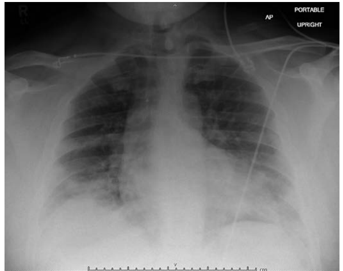
Fig. 2 Chest X-Ray

A male patient in his 40s with a history significant for diabetes and hypertension, presented to the emergency department (ED) reporting a one-week history of fever, chills, and headache. In the ED, his nasal swab sample tested positive for COVID-19 by reverse transcriptase polymerase chain reaction (RT-PCR). He was discharged home due to stable vital signs and clinical condition with no new medications.