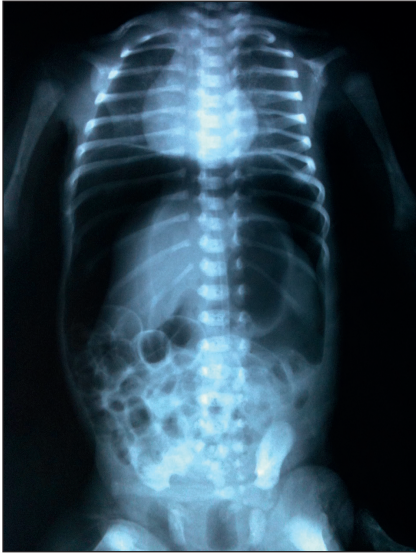
Fig. 1: Abdominal X-ray: massive pneumoperitoneum.