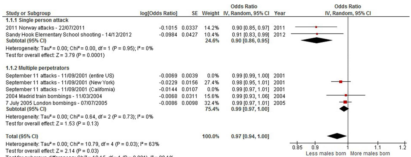
Fig. 3: Forest plot of random effects meta-analysis of the association between early 21st century terrorist attacks and the human live birth sex ratio. Please note the striking difference in effect size between single person attacks and attacks by multiple perpetrators. The September 11 attacks for California and the entire United States (US) are shown so as to display their odds ratio point estimates and 95% confidence intervals, but these did not contribute (Weight = 0.0%) to the pooled estimate.

Being able to obtain the raw live birth data from modern civil registration and vital statistics systems that are highly complete, accurate and timely was a major strength.