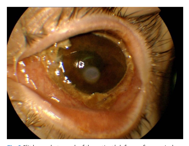
Fig. 2 Slit lamp photograph of the patient's left eye after surgical exploration and debridement. Chemosis, hyperaemia and corneal infiltration are shown. Residual necrotic conjunctival tissue appears brown.

in the structures of the anterior segment in OS (Fig. 1). Surgical exploration revealed no site of injury or foreign body. Large areas of necrotic, brown, frail conjunctiva and sclera were identified, especially underneath the superior eyelid. Careful dissection of the necrotic tissue was performed (Fig. 2).