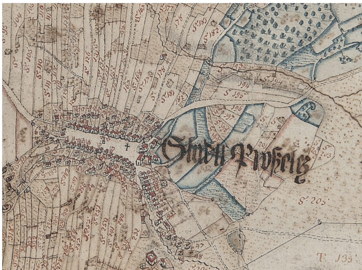
Fig. 3 View of the town of Proseč on the map of the Nové Hradý estate from 1775.