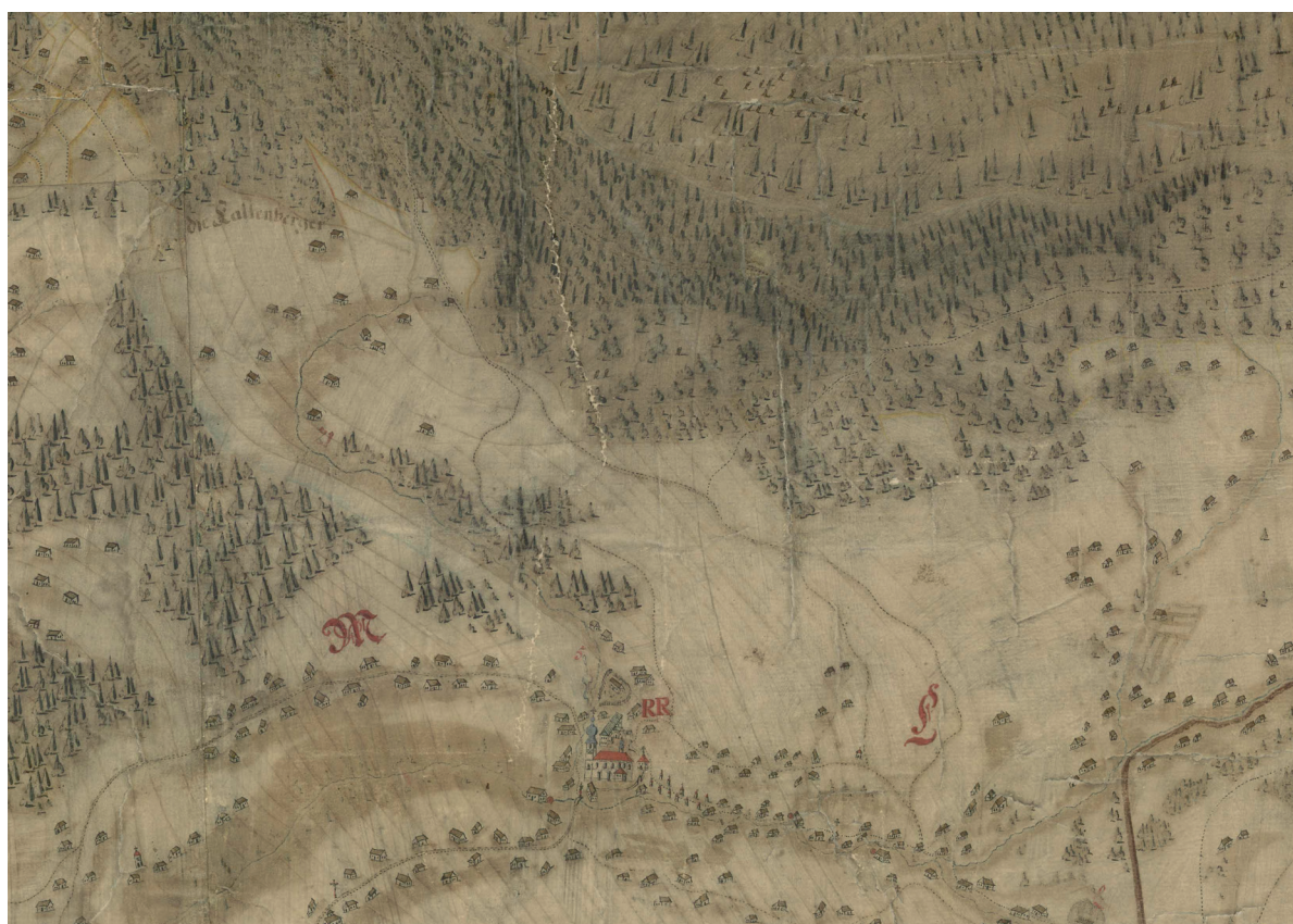
Fig. 4 The Giant Mountains region with a vicarage and pub in Rokytnice on the map of the Jilemnice estate from 1765.