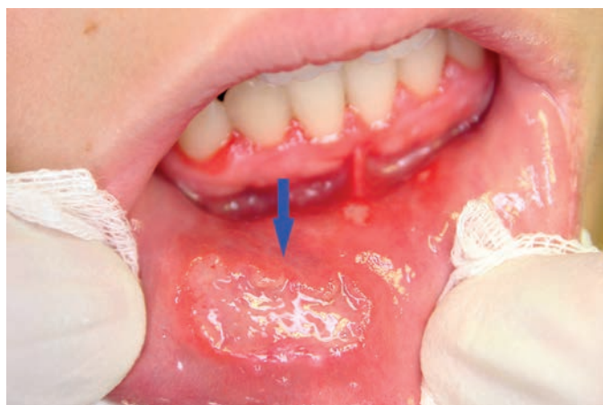
Fig. 2 Aphtha major.