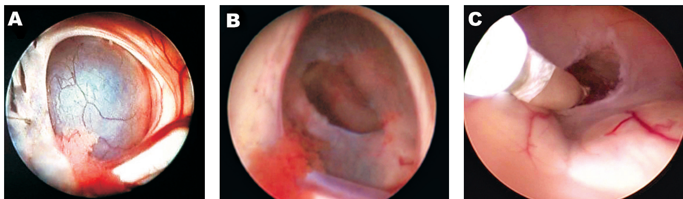
Fig. 2 Neuroendoscopic surgical photographs of a 12-month-old boy included in this study. (A) The view of the foramen of Monro and the third ventricle arachnoid cyst. (B) Fenestrated and dilated cyst wall. (C) After entering the cyst, we proceeded to the third ventricle floor and performed ETV. Fenestrated third ventricle floor can be seen.

Successful ETV or VC+ETV (Figure 2) were performed in 35 of the 40 patients. VPS was applied in case of unsuccessful procedures. The procedures were unsuccessful in 5 patients aged < 1 year. In addition, they had a HC of > 90 percentile at the time of the surgery. ETV was successful in other 5 patients aged < 1 year who had HC of 75–90 percentiles. In our series, the procedure failure was not observed in adult patients and in those of age > 1 year.