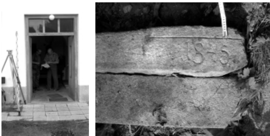
Figure 1: Buda mill near Zruč n. S.: The floor bar with the engraved 1845 mark (right) was removed from the entrance door (left) during renovation.

Field measurement results have been arranged within a topography (Dragoun, 2007). The field investigation confirmed the assumption on disappearance of most flood marks. Literature proves that the oldest flood mark on the Sázava River was on St. Catherine's church building in Havlíčkův Brod and dates back to 1714. However, it was destroyed during its renovation in the 19 th century (Sochr, 1993). Neither the