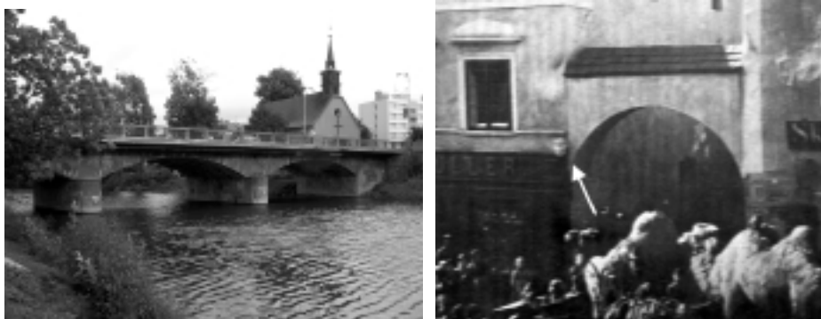
Figure 4: On the left: Havlíčkův Brod; on the left St. Catherine's Church flooded up to ca. 3 m in 1714; on the right 97 Dolní Street; sidewalk height under the "Bearded Man" sculpture corresponds to the flood reach.

Based on a measurement in Havlíčkův Brod, the flood extent corresponds to the distance of today's Riegrova Street and 97 Dolní Street (see also Tbl. 5). The unusually fast water level rise was accompanied by devastation of the river bank town part where, rather coincidentally, only St. Catherine's Church (Fig. 4) remained saved.